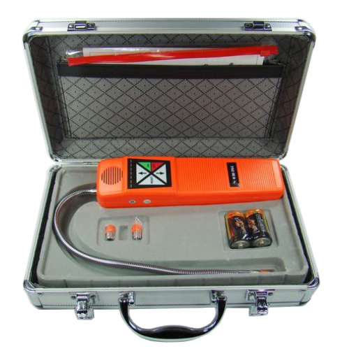
Halogen- Leak- Detector including 2 batteries 2 pcs. replacement sensing tips with protector carrying case and manual